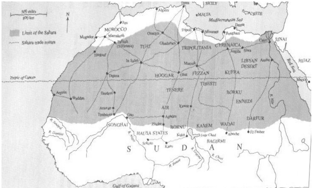
Map 3: Trans-Saharan trade routes